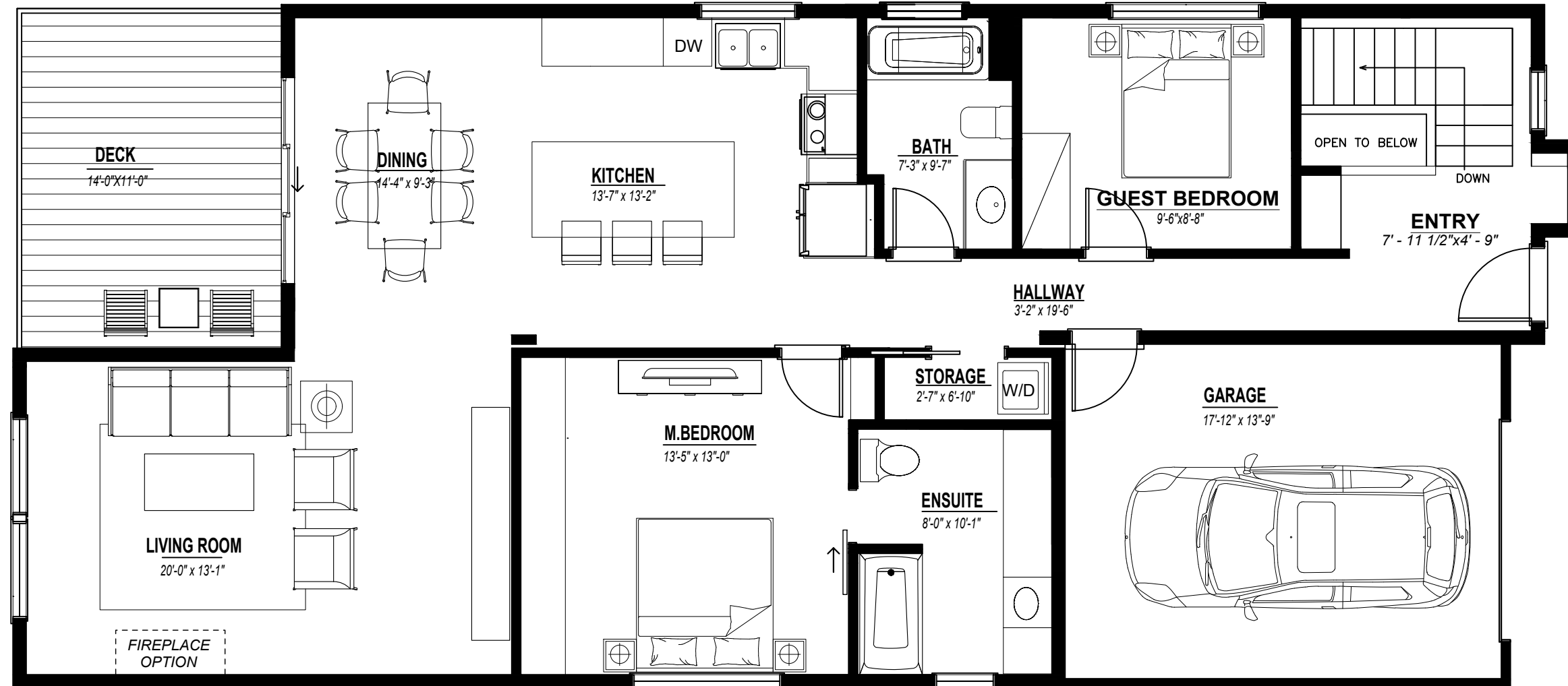
PLAN B : UPPER LEVEL Total Area: 1346 sq.ft.

Note: The Developer reserves the right to make modifications should they be necessary E&OE