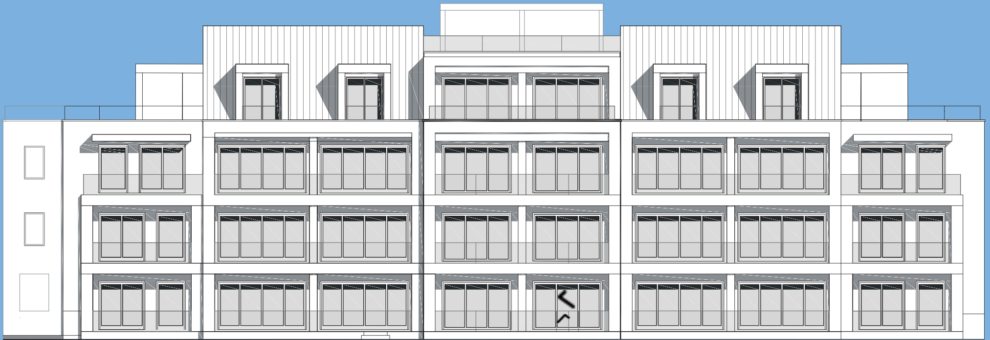
MARINA VIEW ELEVATION